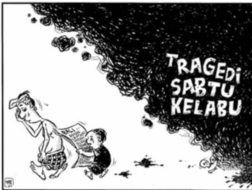
Figure 6. The Tragedy of Black (lit.grey); Bali Post, 16 October 2002.

mainstream Indonesian coverage. Although there were exceptions to this general trend, 48 the vast majority of pictures that were published in the Indonesian press were scenes from ‘the morning after’. Most of the photographs published by the Indonesian press depicted the physical destruction of Kuta from various perspectives – e.g., from in amongst the rubble, from the air – including burnt-out buildings and the smoking remains of cars and other vehicles that were destroyed in the blast. There were also scenes from the hospital, as well as photographs of government and security officials. Perhaps most importantly: these all were images after the fact . And, as such, they differed from the images of what I would describe as terror in progress that dominated the broadly western coverage.